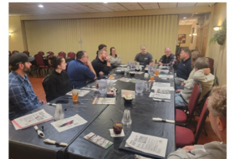
SHOP TALK 2026