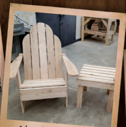
Adirondack Chairs & Table constructed by Chilton High School