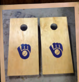
Bean Bag Toss constructed by Chilton High School