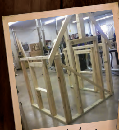
Playhouse constructed by Kiel High School

The Expo is showcasing area High School Tech Ed programs and encouraging students interested in the skilled trades. Support High School Tech Ed programs by purchasing raffle tickets at the expo! 100% of the proceeds will go back to their school! Kiel High School Tech Ed students are building a 5' x 5' Playhouse which features a Dutch door, a hinged window and white fascia and soffits. Chilton High School Tech Ed students are building a pair of Adirondack Chairs and Table and 2 sets of Bean Bag Toss.